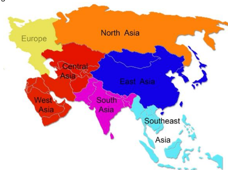
Figure 3: Sub-regions of Asia

The continent is often divided into six sub-regions based on cultural factors such as religion, language and ethnic origins. These regions are Central Asia, East Asia, North Asia, South Asia, Southeast Asia and West Asia. (See Figure 3).