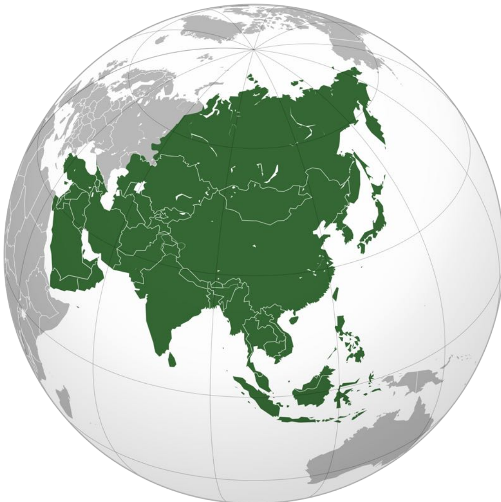
Figure 1: Asia covers a vast area of the Earth's surface.

Asia is home to several of the world's oldest civilizations and the birthplace of its great religions.